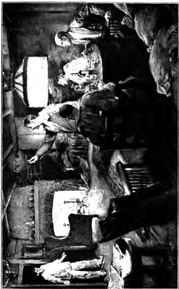
111. The Conquering Hero